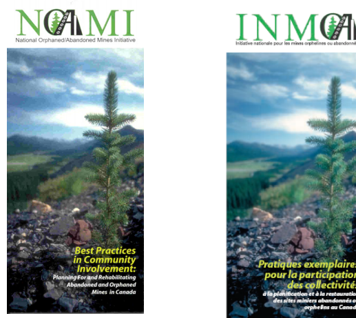
Figure 1. Best Practices Pamphlet (produced in both official languages of Canada)

These principles were developed for use by governments, industry, local communities and other parties as a template for the development of policy and citizen engagement plans prior to, during and after the rehabilitation of problematic sites. The final report and the pamphlet are available on the NOAMI web site ( www.abandoned-mines.org ). NOAMI plans to complete additional community involvement case studies in 2008.