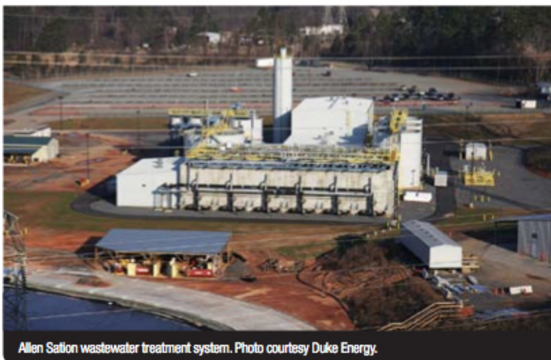
Allen Station wastewater treatment system.